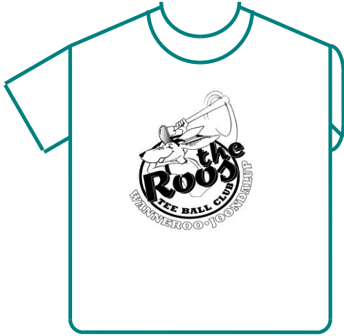
Standard Tee Ball T Shirt with WJTBC Logo (Printed in black or white)