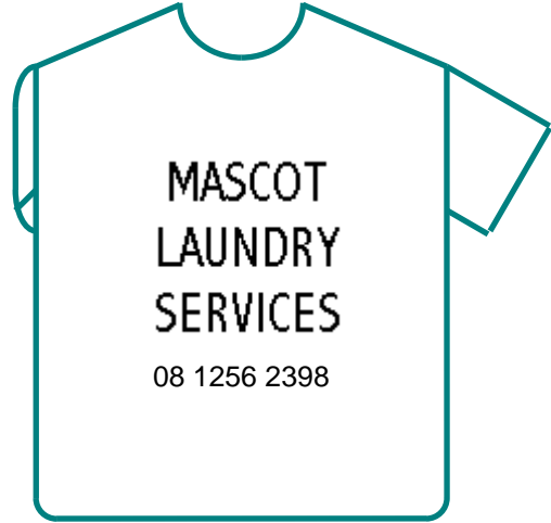
Sponsor's Name - Phone Number (if desired)- only (Max – 2 Colours*) (*Third or more colours are subject to further costs)